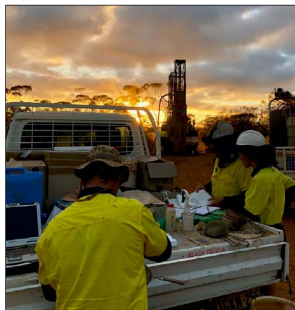
Figure 2 - Drill rig at T8 prospect