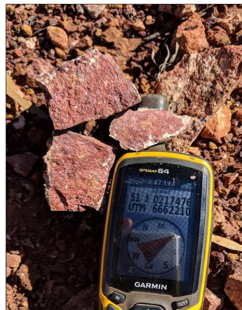
Figure 2 – Felsic rock chip sample grading 15.4 g/t Au